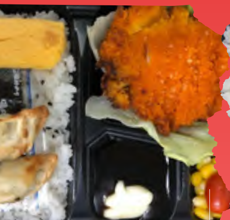
KATSU CHICKEN + GYOZA SET

*ADDITIONAL RM2/SET FOR BIODEGRADABLE PACKING AND CUTLERIES