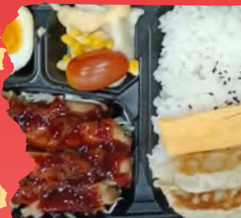
GRILLED CHICKEN + GYOZA SET