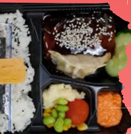
SABA + GYOZA SET