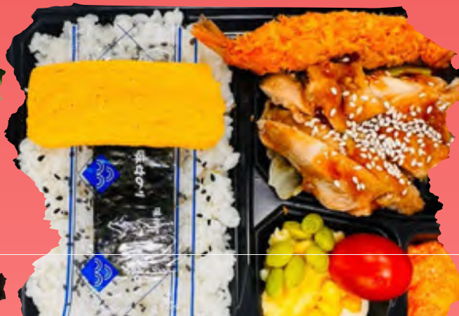
FRIED PRAWN + TERIYAKI CHICKEN SET