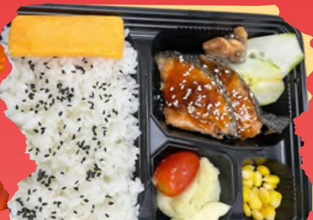
GRILLED SALMON SET